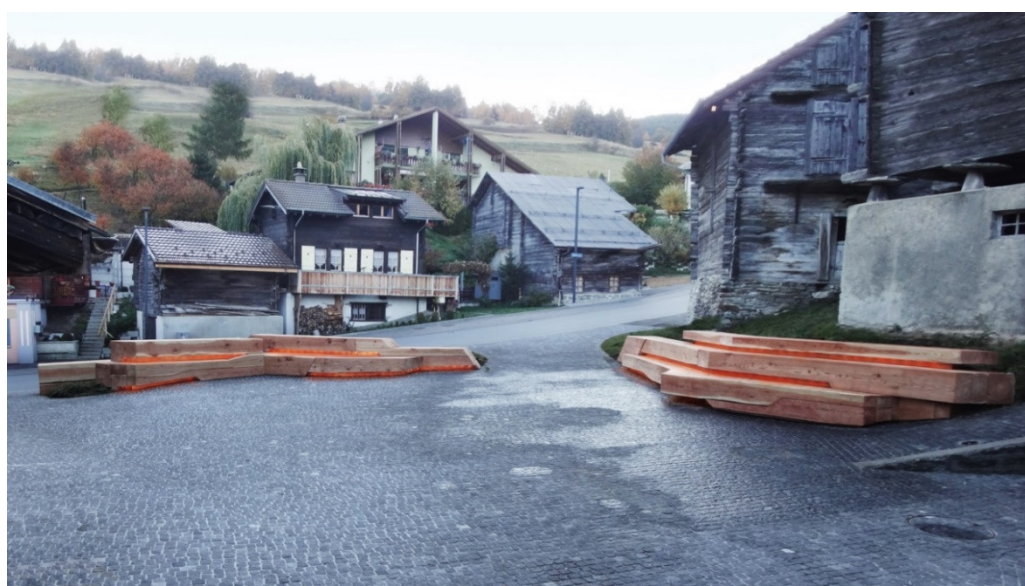
Figure 6. Burchen Mystik, Burchen, Fernando Menis 2013–2015. View of the realized square.