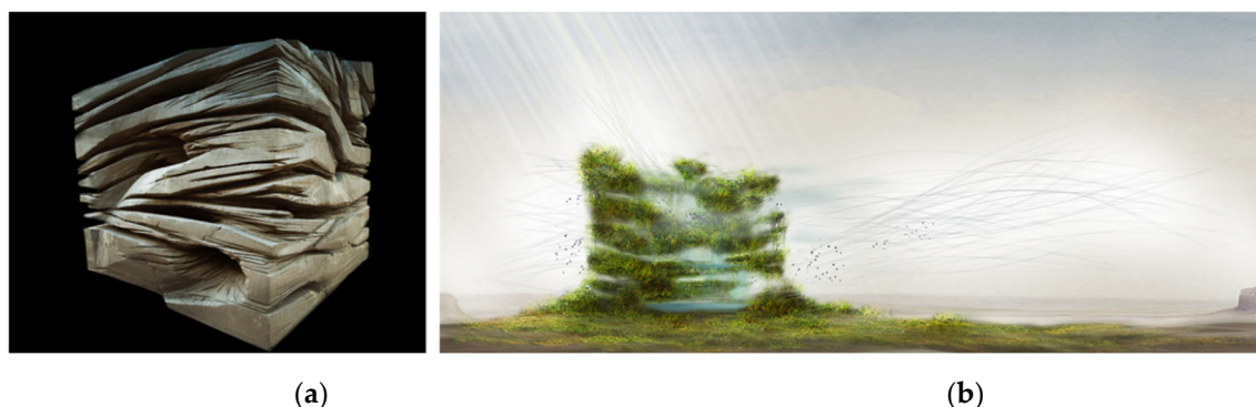
Figure 7. The Hatching—Molding Nature to Make Life Possible, Fernando Menis 2014. Model (a) and concept drawing (b). Photo credit: Fernando Menis.

The Hatching—Molding Nature to Make Life Possible (2014) project is a utopian machine to explore the ability of natural forces to create a life-friendly microclimate in an inhospitable environment. Invited at the Architecture Venice Biennale of 2014 in the Morocco Pavillon, Menis proposes a cubic volume, with a 1 km long side, imagined in the Sahara Desert. This abstract volume becomes a habitable place, thanks to its ability to capture the fresh and humid winds of the Atlantic Ocean that, eroding the structure, make it porous. The humidity trapped in its meanders favors the growth of vegetation, triggering a water circulation. This water, together with natural ventilation, light, and heat from the sun, contributes to creating a new three-dimensional oasis in the desert, capable of exemplifying the rethinking of a sustainable habitat (Figure 7). A life machine that consumes zero energy, Hatching aims to demonstrate that an architectural structure can produce life through the exclusive use of the forces of nature and the manipulation of forms [43].