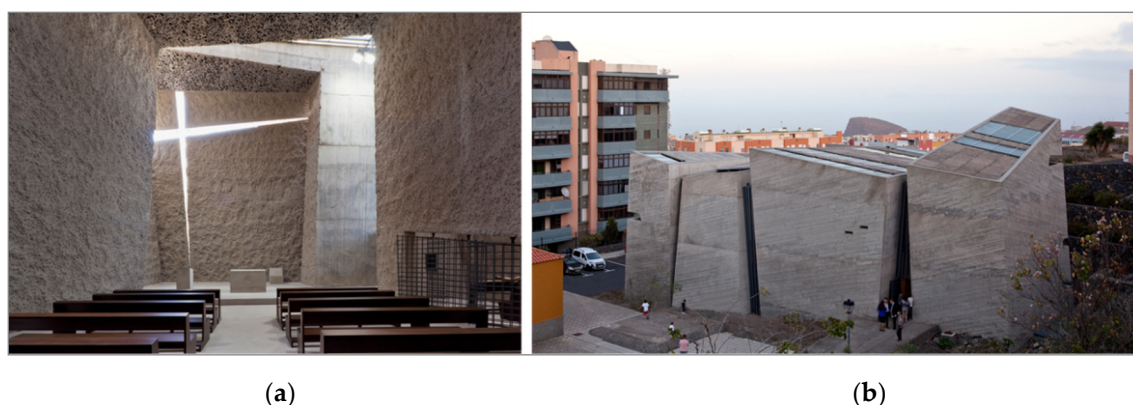
Figure 3. The Holy Redeemer Church, La Laguna, Fernando Menis 1997–2002. Interiors (a) and external view (b).