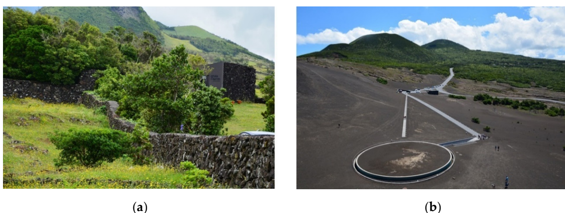
Figure 1. (a) Visitor Center Gruta das Torres, Pico Island (Azores), Sami arquitectos 2005; (b) Capelinhos Volcano Interpretation Centre, Fajal Island (Azores), Nuno Ribeiro Lopes 2008.