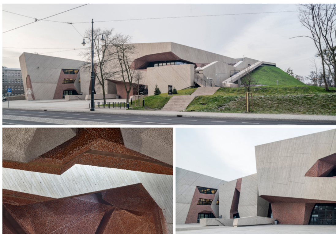
Figure 5. Cultural Center CKK Jordanki, Torun, Fernando Menis 2011–2015. General view and details.

is looking for authentic experiences to be enjoyed in freedom, without any mediation or imposed filter. The tourist infrastructure dissolves into the natural landscape and tells the history of the places to those who pass through it. In the small square, the only realization—to date—of the project currently underway, Menis involves the local sawmill, which is in crisis due to regulatory changes that penalize its economic activities. The sawmill was asked to make the benches, which therefore become a showcase for the technical possibilities of wood. Reinterpreting traditional geometries and plastic qualities of this material, it was possible to create new types of sustainable urban furniture that can also be used in other contexts. The idea that architecture can play an economic and social welfare role is also part of landscape sustainability in the broad sense.