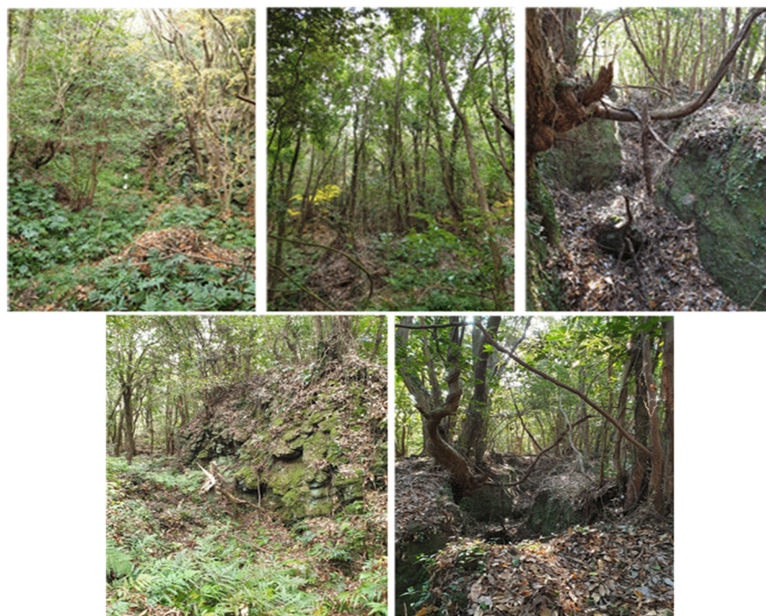
Figure 2. Topography in Sahn-Yang Gotjawal [32].

terrain. (Figure 1) Gotjawal is a lush greenery on Jeju Island and is a local term that is used for the area where trees and vines are entangled on a rocky hillside mostly under the mountains [31]. It is the only place in the world where tropical northern limit plants and southern Korea limit plants coexist. When volcanoes erupt, high-viscosity lava is divided into large and small rock masses and forms a rough terrain. On top of that, natural forest vines and mixed vegetation are present [32] (Figure 2). When it rains, the underground water accumulates, and it is considered the main source of spring water [33]. Gotjawal is a microclimate area that can sustain an even temperature and provides a stable habitat for wild animals and plants [30]. The amount of phytoncide released from plants in Gotjawal is high so it can prevent pathogen infection, purify air, remove odors, and even heal visitors.