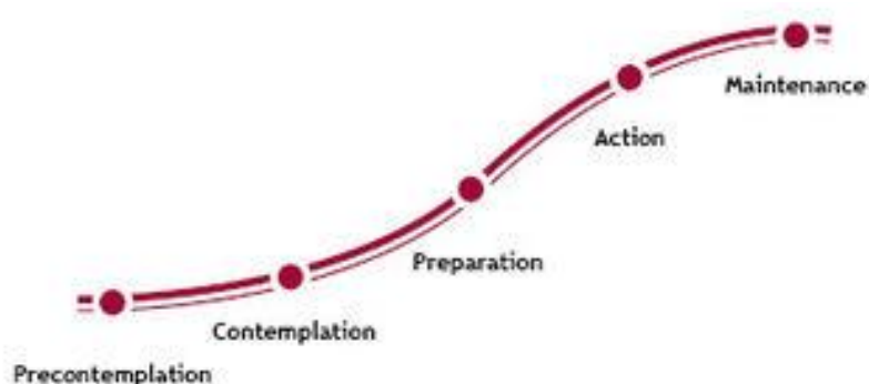
Figure 3. The stages of change according to the Transtheoretical model [27].

The group of non-walkers can be divided into subgroups with different statuses of self-awareness. Our suggestion is to detect different statuses of self-awareness by applying the model of Prochaska [27] (see Figure 3), e.g., according to the importance attributed to walking and the (expressed) preparedness to "buy" the "product", i.e., to walk more. The stages of change according to this model are: 1) Pre-contemplation—where the individual has no intention of changing his/her behavior and even resists change; 2) Contemplation—where the individual starts to become aware of the problem, but without any concrete intentions yet; 3) Preparation—where the individual starts developing preparations for change; 4) Action—where change has occurred but where there is still the risk that the individual could revert to their previous behavior patterns; 5) Maintenance—where the new behavior starts becoming a habit, and 6) Termination—where the new behavior is established and the individual is not likely to revert to their old behavior. We would consider people in stages 1 to 3 to be non-walkers, according to this model.