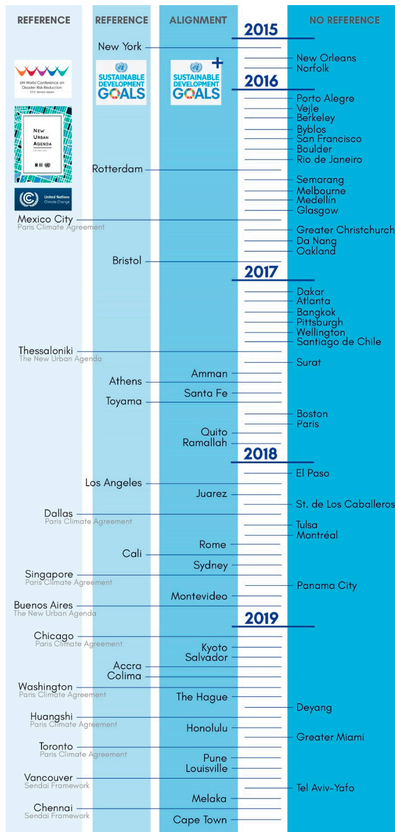
Figure 2. Resilience strategies and global policy alignment. Source: Authors.

agreements); or the New Urban Agenda, adopted in October 2016 (many of the Latin American cities such as Quito, Ecuador; Montevideo, Uruguay; and Buenos Aires, Argentina as well as Thessaloniki, Greece; Santa Fe, US; and Melaka, Malaysia).