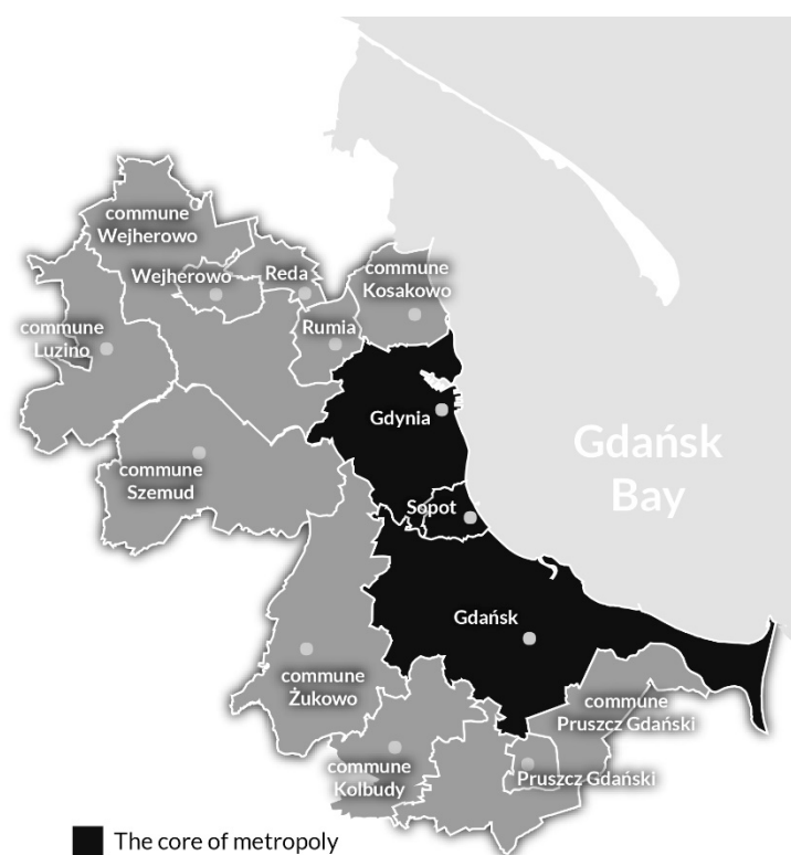
Figure 2. Metropolis of Gdansk Bay.

The public transport network in the study area is created by: bus lines, trolleybus lines, urban railway lines and metropolitan railway lines. Public transport is disintegrated and managed by Public Transport Boards, one commune (buses, trams and trolleybuses), as well as voivodeship office (railway). FFPT for students was introduced on bus, tram and trolleybus lines. Table 1 presents the profile of cities and communes included in the analysis.