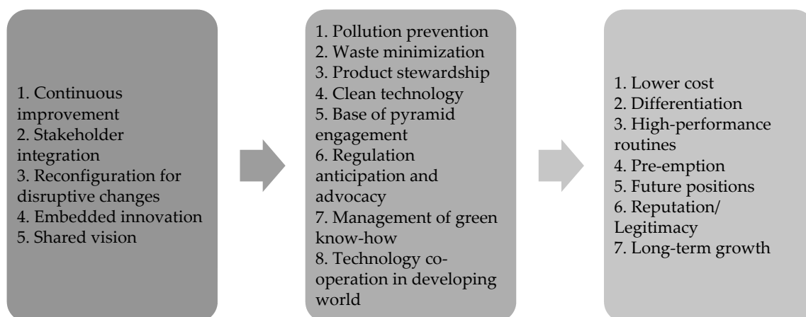
Figure 1. Creating competitive advantage by integrating sustainability.

As mentioned above, it is commonly claimed that a company's fully integrated sustainable approach can lead to competitive advantage (e.g., [20,61]). The resource-based view (RBV) is one approach that can be used to determine the development of competitive advantage through the integration of sustainability into corporate strategy [21]. The RBV first identifies a company's valuable, rare, inimitable, and nonsubstitutable resources, which then create certain capabilities. In the last step, competitive advantage is generated [114]. Figure 1 illustrates the flow from key sustainability-related resources over capabilities to competitive advantages when integrating sustainability into corporate strategy.