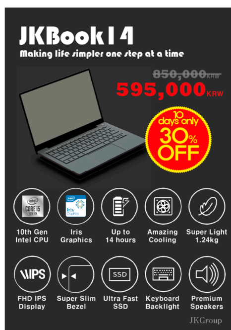
Figure 1. Experimental Stimulus for Study 1.

Two sets of questionnaires were prepared for study 1. Figure 1 shows an advertising for an imaginary laptop, which represents a new product, created as an experimental stimulus. This advertising was shown to the participants for questionnaire 1, whereas the same advertising and five positive consumer reviews were shown to participants for questionnaire 2 to manipulate the difference in perceived quality uncertainty. Then, modified measurements of a prior study were used to check the manipulation [3,20] as follows: (1) Sufficient information was available to judge the product quality. (2) Much useful information regarding product quality is available. (3) I can assess the product quality.