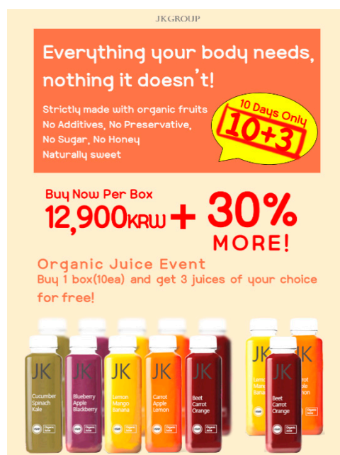
Figure 3. Experimental Stimulus for Study 2.

compared with direct price discount [13,31], and a juice product is a low involvement good with a short shelf life. Therefore, repeated promotions may be needed as the expiry date approaches. Following study 1, a value-added promotion with 30% more was chosen.