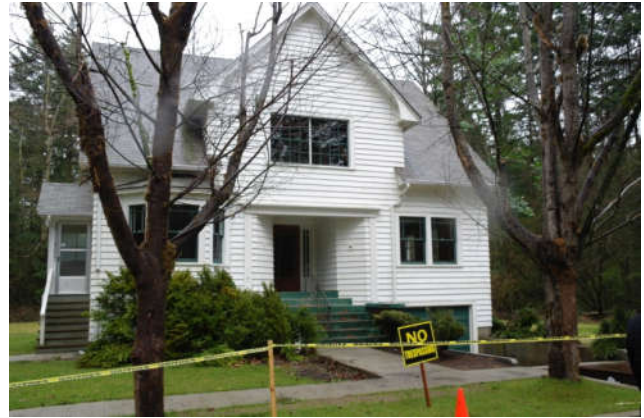
Figure 2. Twilight Saga tourists are confronted with barriers and security staff at the site of the Swan family house film location in British Columbia, Canada. The set location was later demolished by the production company.

The study's results also showcase how important social aspects are in the creation of fictional images. A popular culture tourist guide's knowledge and storytelling abilities are central for making servicescapes come alive. For example, photographs and video clips showcasing props like screen shots from movies were used by guides to assist in telling the story of film production during guided tours. This is particularly important when there are few or no physical signs left behind after a film production or when a film production is surrounded by a high level of secrecy and security (see Figure 2) during filming (as with the Twilight Saga). Then, any inside information gathered by the local tour guides as to the who, the why, and the wherefores is vital for the tourist experience of servicescapes. This is noteworthy as it adds a new dimension to existing servicescape research, as these places are not designed for tourists and often demolished as soon as the filming has come to an end.