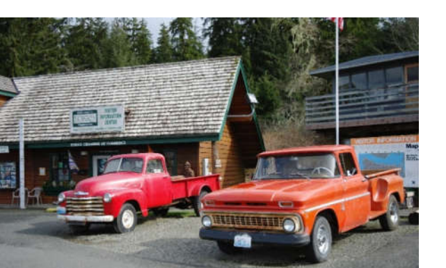
Figure 1. Twilight Saga character Bella Swan's car parked outside Forks Visitor Center, WA, USA. One of the car models is described in the books and the other used in the films.

The study's results also showcase how important social aspects are in the creation of fictional images. A popular culture tourist guide's knowledge and storytelling abilities are central for making servicescapes come alive. For example, photographs and video clips showcasing props like screen shots from movies were used by guides to assist in telling the story of film production during guided tours. This is particularly important when there are few or no physical signs left behind after a film production or when a film production is surrounded by a high level of secrecy and security (see Figure 2) during filming (as with the Twilight Saga). Then, any inside information gathered by the local tour guides as to the who, the why, and the wherefores is vital for the tourist experience of servicescapes. This is noteworthy as it adds a new dimension to existing servicescape research, as these places are not designed for tourists and often demolished as soon as the filming has come to an end.