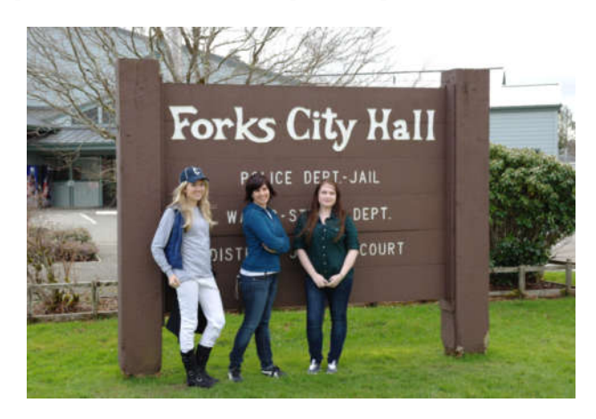
Figure 3. Tourists dress up as the Twilight Saga characters. Rosalie, Alice, and Bella during their visit in Forks, WA, USA.

that the servicescape happens to be on private property. Access to servicescapes can also be defined by level of knowledge/information of a particular place such as film locations and their related venues. Another addition to the social dimension of servicescapes at popular culture tourism destinations is the visitors playing an important part in creating a heightened experience of the servicescape. For example, visiting fans interact with each other at different attractions and share experiences and information with each other (e.g., film production details or on meeting the actors/author). Fans that travel to a destination for cosplay (i.e., dressed up as characters of the series) and/or fans re-enacting scenes from the books or films also add to a heightened or immersed experience for visitors (see Figure 3). In some cases, they even become the attraction themselves and part of the servicescape when other tourists take photographs of or together with them.