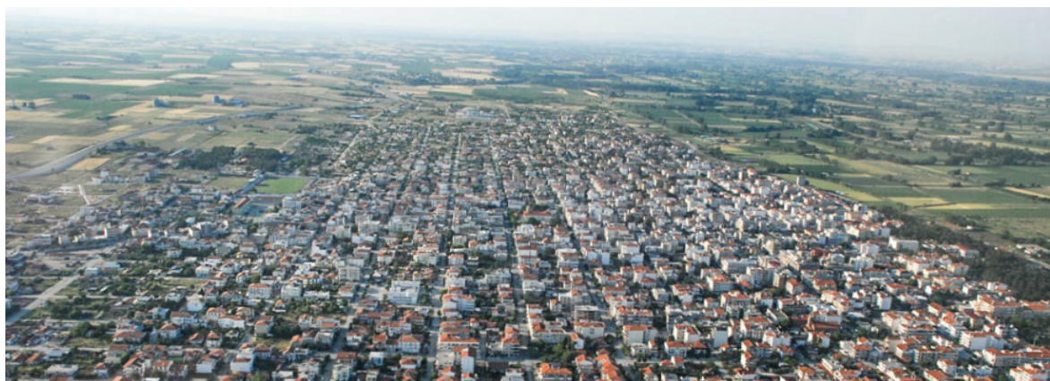
Figure 2. The city of Orestiada, Greece.