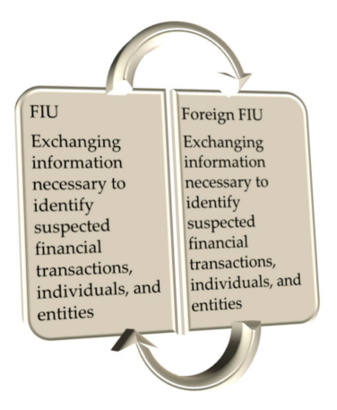
Figure 3. Cooperation between FIU and foreign FIU. Source: Own elaboration based on [1,50].