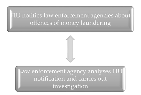
Figure 2. Cooperation between FIU and law enforcement agency.

FIUs cooperates with law enforcement agencies by notifying them of offences of money laundering (Figure 2). Domestic FIUs cooperate with foreign FIUs based on bilateral agreements (Figure 3). FIUs exchange information necessary to identify suspected financial transactions, individuals, and entities [1,50].