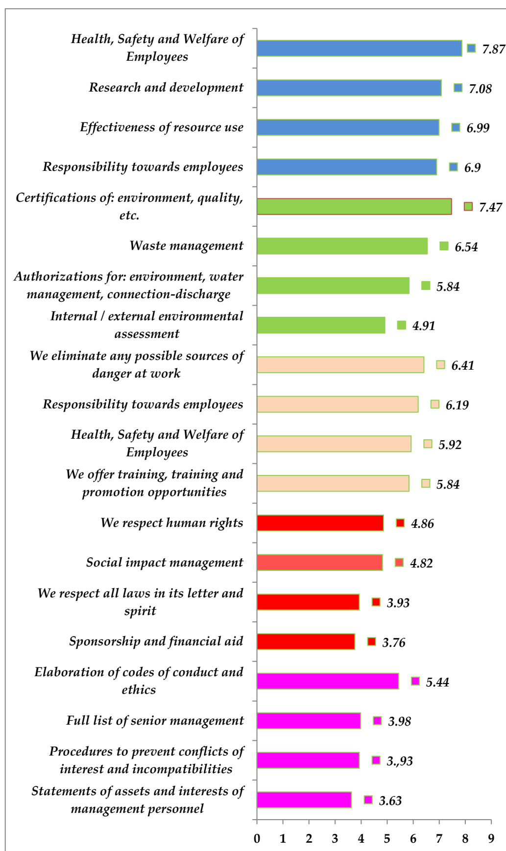
Figure 2. The impact of the main information or actions disclosed in the corporate social responsibility (CSR) reports.