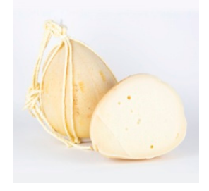
Figure 1. Provolone del Monaco.

Provolone del Monaco's typical shape is shown in Figure 1; the chemical composition at different ripening times and sampled at different portions is reported in Table 1.