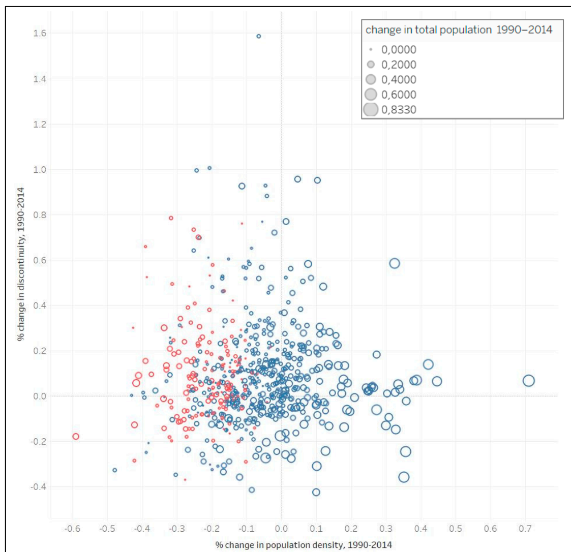
Figure 1. Dynamics of population density and built-up area discontinuity in European cities, 1990–2014. The figure compares the change in population density (horizontal axis) and discontinuity (vertical axis) in the sample of European functional urban areas (FUAs). The size of the circle shows the absolute value of the percentage change in total population in the relative FUA; a red circle indicates that the population is shrinking, a blue one a population that is growing. The values of population change in decimal points corresponding to the size of the circle are reported in the upper-right part of the figure. Three cities (Tallinn, Guadalajara and Walbrzych) have been excluded because a population growth greater than 100% makes them outliers in this figure.

To study the dynamics of the variables and analyse local patterns of variations, we made some simplifying assumptions. First, we assumed that the dynamics of the variables of interest can be described with discrete variables taking the values -1, 0, 1 if the value of the variable decreases, remains stable, or increases in the city, respectively. This process clearly hinders large variation, especially in the extremes, but it considerably simplifies the description of the dynamics without changing the overall picture. Second, we assumed that small variations in either direction should not be considered. This assumption guarantees that a sufficient number of observations was assigned a value equal to 0 for each variable and that sufficiently small movements in the value of the variable were not considered equivalent to relatively larger movements. In the analysis, we considered small a variation that was below 1%.