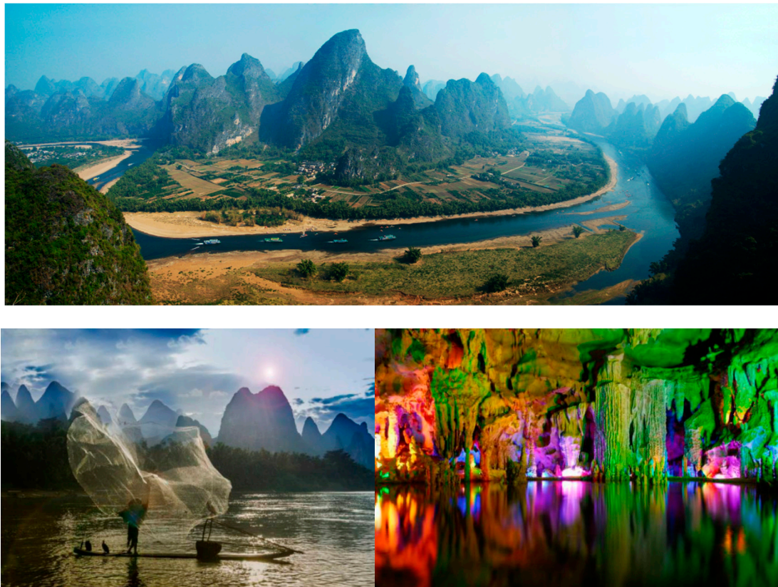
Figure 1. Scenic views of the Li River.

one of Southern China's most visited destinations for domestic and international tourists, attracting more than 80 million visitors in 2017 [12]. The famous landscapes of the Li River are shown in Figure 1.