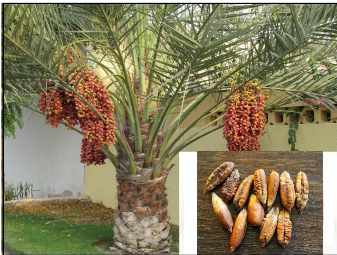
Figure 1. Phoenix dactylifera , popularly called finger palm.

For this reason, this article seeks to study new possibilities of date seeds as biofuel for boilers in the Mediterranean climate, using a University in the south of Spain as a case study, in which the calculated carbon footprint has halved from 2012 to 2017, which should improve energy saving in the buildings of the university.