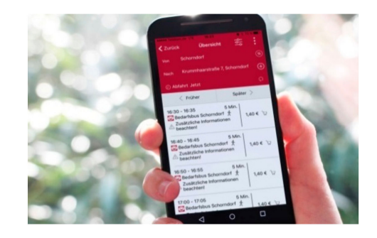
Figure 2. Smartphone App for booking the bus © DLR.