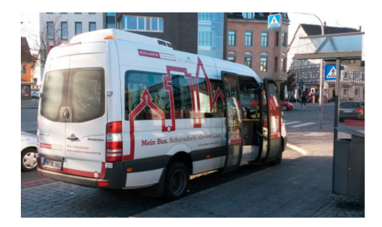
Figure 3. One of the buses that operated the on-demand bus system (barrier-free Minibus) © DLR.