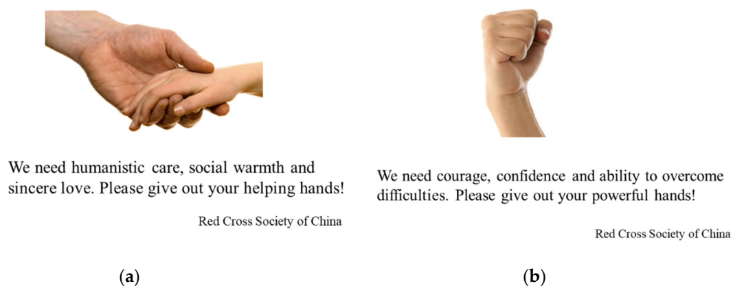
Figure 2. Advertising with (a) warm appeals and (b) competent appeals.

First, participants were required to read the advertising and then rate the advertising on a warmth–competence scale. We included both a text description and pictures in the advertising so as to make the feeling of warmth and competence more intense after viewing the advertisement. In order to prevent the influence of color on experiment, we used pictures printed in grayscale (black and white). Following Peng and Bi, we varied the pictures and advertising slogans according to different advertising appeals [62]. Specifically, in the warm appeal condition, a picture of a handshake was used in the advertising with a slogan as shown in Figure 2a; in the competent appeal condition, a picture of a fist was used in the advertising with a slogan as shown in Figure 2b.