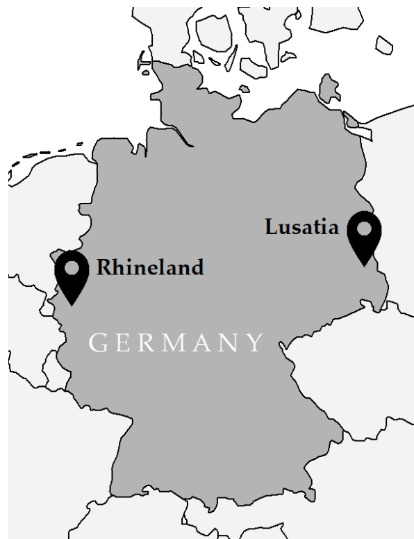
Figure 1. Location of the study regions Rhineland and Lusatia.

a fixed end-date. Its recommendation of phasing out coal by 2035–2038 [10] is a compromise between claims to phase out coal by 2030 to meet the Paris Agreement [11] and concerns of representatives of the lignite regions asking for sufficient time to manage the structural change. As of September 2019, the recommendations of the commission are currently being transferred and specified in the so-called Structural Enhancement Act (Strukturstärkungsgesetz), to be passed by the end of 2019.