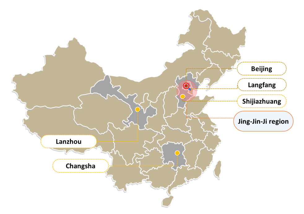
Figure 2. Geographical locations of the selected cities.

An online web questionnaire was conducted between September and November 2017. The questionnaire contained 41 questions primarily concerning respondents' perceptions, knowledge, attitudes, and expectations concerning SDGs, along with basic demographic data. On the basis of city size (mega, big, and small cities) and geographic location (northern, central, and western areas; see Figure 2), we carefully selected five cities in China for our investigation. Of these five cities, Beijing, Shijiazhuang, and Langfang are located in the Jing-Jin-Ji region but differ in size; and Shijiazhuang, Changsha, and Lanzhou are all provincial capitals but in different locations (see Table 2).