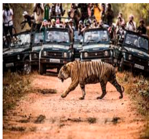
Figure 3. Tourists converging for tiger sighting in CTR, Ramnagar, on 29 June 2016.

The Royal Bengal tiger is a highly endangered species, and tourists who encountered the special species expressed a high level of awe and appreciation. Confirming this belief, a senior administrative officer at Ramnagar forest division mentioned: “Tourists just want to see a tiger, and they do not seem