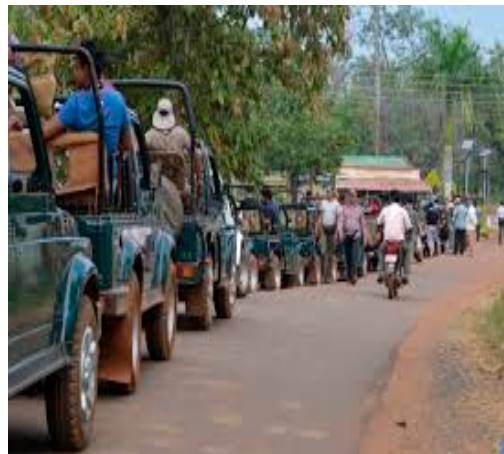
Figure 2. Tourists waiting to get into CTR, Ramnagar, on 28 June 2016.

Tourists are allowed to carry food, water bottles, and mobile phones in a bag, and before embarking on the trip, they are given a haphazard and vague briefing by a nature guide and forest guard on environmental safekeeping inside CTR (Figure 2). Throughout the journey, many tourists are seen littering in the park, arguing with the staff to allow them to enter the restricted core area or for deviating from the prescribed route. Some tourists also attempted to alight from their vehicle, often leading to arguments and confrontations between the tourists and guides/drivers. During the safari, the accompanying guide and driver are repeatedly cajoled by tourists to ensure tiger sighting. Once a tiger is sighted, the information is swiftly relayed to each other by drivers and guides active in the area through mobile phones, and in a matter of minutes, more than 50 vehicles converge at that spot to catch a glimpse of the animal (Figure 3).