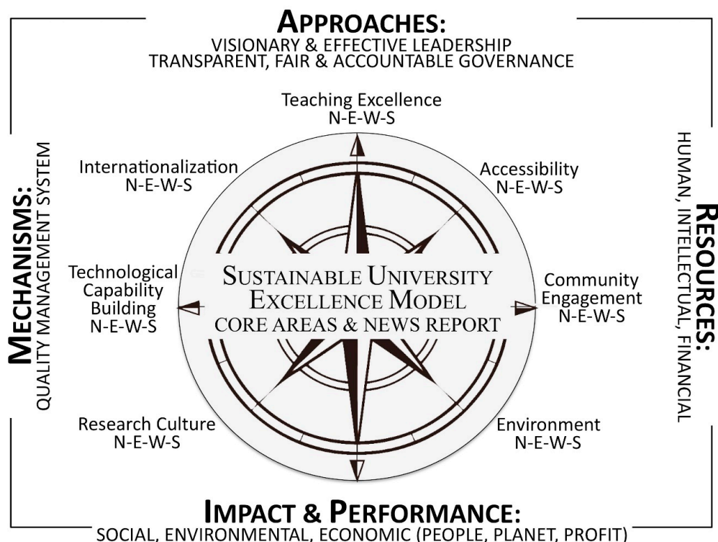
Figure 1. Sustainable University Excellence Model.

The selection of the symbols N-E-W-S is highly intentional in that these connote to the four primary directions on a compass (North, East, West and South) that when arranged in the stated order spell the word news . As such, springboard assessment associated with the SUEM is intended to provide insight into current performance—e.g., “news”—and foresight into where to move next and how to do so, that is, a compass (N-E-W-S) [128].