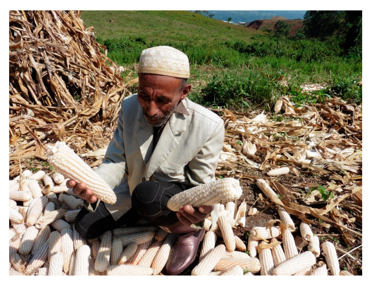
Figure 3. A farmer in Yayu showing his preferred maize variety.

than a glass of maize cereals. Further, it withstands dry weather conditions and produces good quality flour."