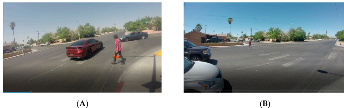
Figure 1. (A) Example of vehicle failing to yield while the pedestrian is in the roadway. (B) Example of vehicles yielding to the pedestrian crossing the roadway at a midblock crosswalk in Las Vegas, NV.

analyzed using a two-way analysis of variance (ANOVA) to examine the effects PCFs had on (1) the number of vehicles that passed in the nearest lane without yielding while the pedestrian waited at the curb ready to enter the roadway and (2) the number of vehicles that passed through the crosswalk while the pedestrian was in the same half of the roadway. See Figure 1 for example photos of the mid-block crosswalk test sites. Analysis was conducted with IBM SPSS Statistics 25 (IBM Corp., Armonk, NY, USA).