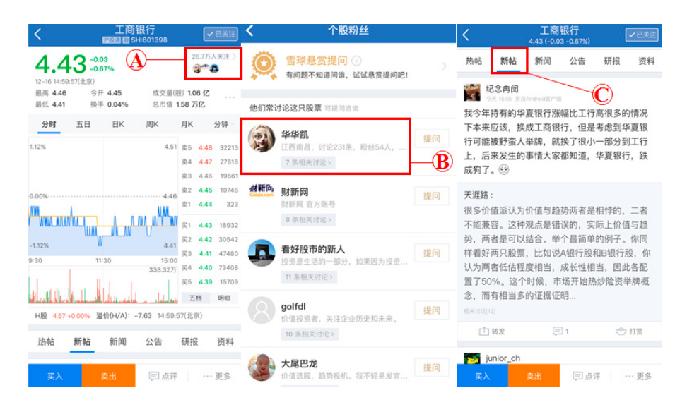
Figure 2. Snowball.net screenshot (typical online group page).

Figure 2 illustrates a typical online group interface regarding a stock (Industrial and Commercial Bank of China, No. 601398) posted in Chinese. Three key pieces of information are included. Part A shows the total number of online group members, which is updated in real time. Part B shows individual characteristics of the in-group members, including nickname, brief introductions, number of in-group knowledge-sharing posts, number of followings, and number of fans. Part C shows the latest knowledge-sharing posts generated by in-group members.