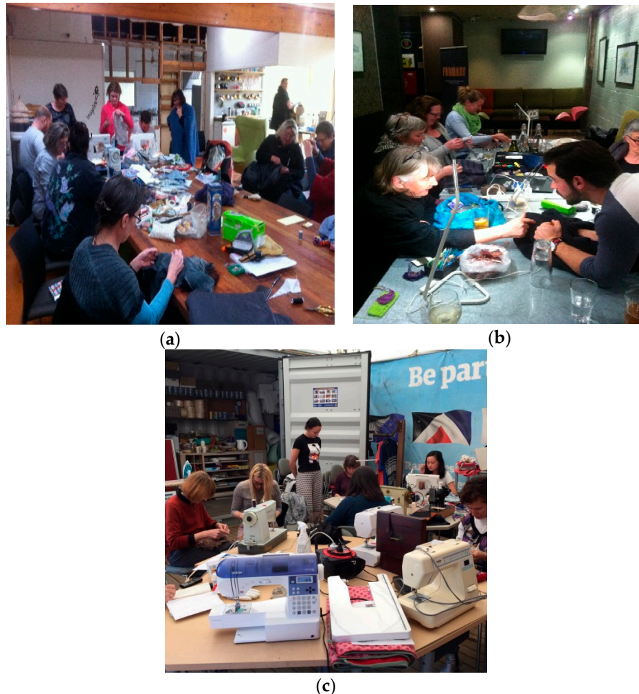
Figure 1. Communal garment-mending workshops in New Zealand: (a) Menders mend at the Gribblehirst Community Center repair workshop, 2017; (b) A workshop session in Wellington hosted by On the Mend, 2017; (c) Garment-mending workshop at the Community Recycling Centre at Devonport, Auckland, 2017.

sat together around it doing both hand and machine mends. Two of the chosen groups were-based in Auckland and one in Wellington (Figure 1). Each of the organizing groups is presented below, followed by a description of the participants/menders that came to the workshops.