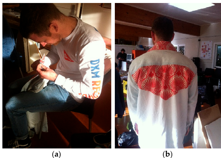
Figure 2. (a) Re-doer mends the frayed collar of an old shirt and (b) re-designs it entirely using scrap fabric found in the workshop. Gribblehirst Community Hub workshop, Auckland, New Zealand, 2017.

Re-doer: “I learned here, kind of a decorative techniques or cross stitching { ... } you can add a bit more personality to it so instead off just patching something or mending with exactly the same color. You put a completely different color on and it just stands out and I think it’s cool. It makes it a bit more individual but it is also a bit more fun too”.