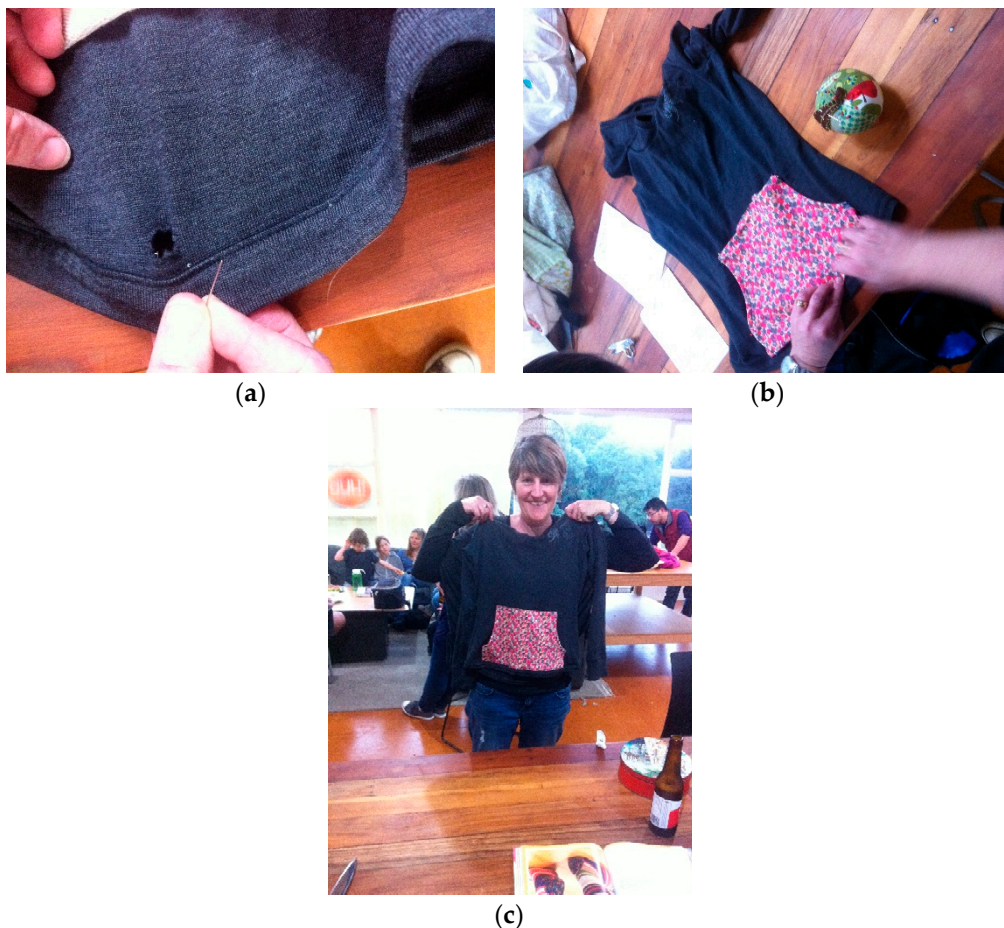
Figure 5. Mender feeling joyful after mending a hole in the garment visibly, resulting in extending its useful life and adding aesthetic quality to it (a–c), 2017.

Recruit: “It makes you feel like you have a lot of new stuff. Because when you mend things you can fix things and change them if you want to change them and you feel more comfortable being able to repurpose things and make something feel new. So [it] makes you feel differently about your clothes. It feels like you are learning something creative and an art almost”.