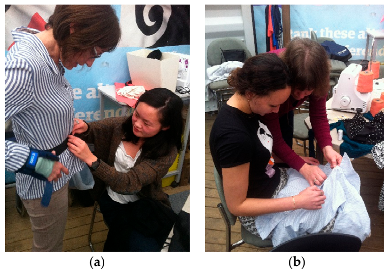
Figure 4. Menders working with and through others to learn how to mend (a) Restorer (volunteer expert mender) helping reluctant measure waist band to fix leggings, 2017; (b) Recruit mender watching carefully as the expert guides her on how to stitch back a button. Mending event at Community Recycling Center, Devonport, Auckland, New Zealand, 2017.

Mending in groups not only reflected how learning took shape but also led menders to learn how to be self-reliant. Participation in communal workshops helped them to learn the technicalities of the skill of mending while also bolstering the confidence of many, particularly among the recruits and the reluctants, as shown by the following excerpts: