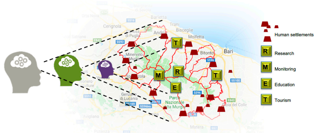
Figure 3. A systems-based representation of the Alta Murgia National Park governance structure [86,87].

The promoted cultural value of protected areas emerges here not so much for the inclusion of cultural goods within the local offering system but for embracing an enhancement view that leverages the capability of integrating the three dimensions of sustainability under an overall view of sustainable development, i.e., the core of protected areas. Culture, in our view, is not a further dimension but a general paradigm of reference to define coherently the offering system of the territory to the variety of potential beneficiaries as well as to local communities. Placed at the centre of the development strategy of the territory as whole, protected areas become the core model to promote truly sustainable development. As suggested by Figure 3, a three-level governance perspective should inform the development strategy, including more systematic research and education activities in the management of the protected area. In this perspective, the touristic activities that currently represent the core of the development strategy would benefit from the wider attraction potential of a cultural value based on the capability of the area to live and promote sustainable development.