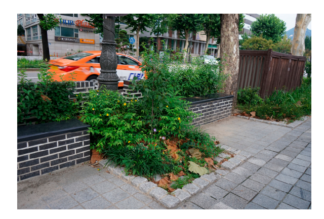
Figure 2. Picture of case study site B.

Site B could be categorized as a typical urban streetscape area. It was constructed on the limited size of existing street flowerbeds. Platanus and Lagerstroemia indica were planted as a colonnade, where shrubs such as Kerria japonica , Kerria , and Euonymus alatus , and herbaceous species such as Liriope muscari , Platycodon grandiflorus , were planted (Figure 2).