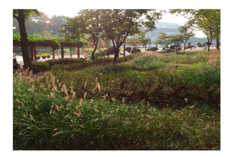
Figure 3. Picture of case study site C.

Site C was constructed in a comparatively large area, including places for walking and relaxing. Site C was composed with trees, such as Quercus variabilis and Pinus strobus . Rhododendron indicum and a variety of herbaceous species, such as Hosta, Liriope muscari, Convallaria majalis, Mukdenia rossii, Penniseum alopecuroides , and Iris ensata , were also planted under the existing trees (Figure 3).