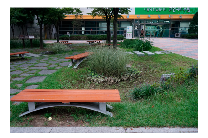
Figure 1. Picture of case study site A.

Site A, close to a public building, was composed to assist infiltration actions in a relatively smaller area where rain gardens were formed beside benches (Figure 1). Zelkova serrata was planted as a canopy. Shrubs, such as Buxus koreana and Rhododendron indicum , and herbaceous species, such as Pennisetum alopecuroides , Liriope muscari , Zoysia spp., and Carex boottiana were also planted.