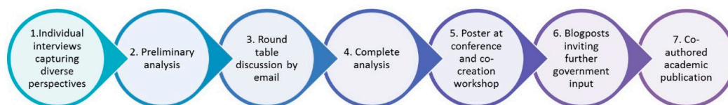
Figure 2. Government engagement process during data collection, analysis, and presentation.

Governmental partners were engaged in an iterative process of data collection and analysis (Figure 2), which was designed following the principles of participation process management and participatory action research [10–12]. Please find detailed insights of the application of these principles in RRfW in Velenturf and Purnell [8]. The RRfW process aimed at the co-production of a vision and approach with individuals who are active in waste and resource management policy-making and regulation in order to create ownership of the results and build commitment for uptake. In this article, the results are shared from the first stages of the government engagement in the participatory action research process, including: forming an initial stakeholder group, analysing the problem, identifying solutions, and appraising solutions to implement change (and striving to realise them through ongoing collaboration in the future). The process design was shaped by the RRfW academic team in collaboration with governmental partners, including the Department for Food and Rural Affairs (DEFRA) and the Environment Agency (EA); the latter was advised mainly on the positioning and wording of the questions listed below in order to bring forward the relevance of this research project for people in governmental organisations and increase the likelihood of a productive interaction during this study.