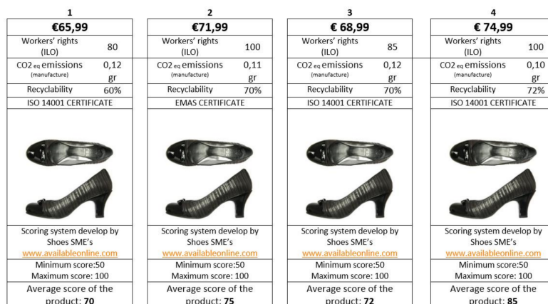
Figure 1. Comparison of shoe labels proposed in survey.