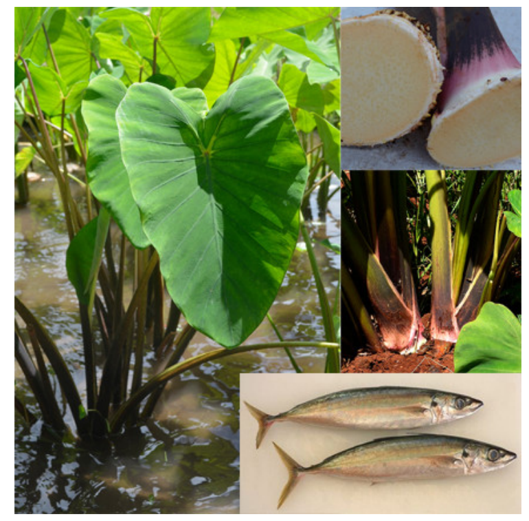
Figure 2. Kalo Mana 'ōpelu and i'a 'ōpelu ( Decapterus pinnulatus ). P. Levin 2014 (taro) and J. Konanui 2014 (fish).

Accurately identifying Hawaiian kalo cultivars (approx. 60 remain) relies on recognizing morphological characteristics, still the most practical method for varietal recognition. Thirteen Hawaii-based botanical gardens, university research stations and individuals now maintain kalo assemblages in the islands. Over the last two decades, regular collaboration between taro experts and plant managers has improved identification and shifted some collections from solely conservation to interactive education, active propagation and distribution. With that, a larger public is being reintroduced to the cultivars and their names.