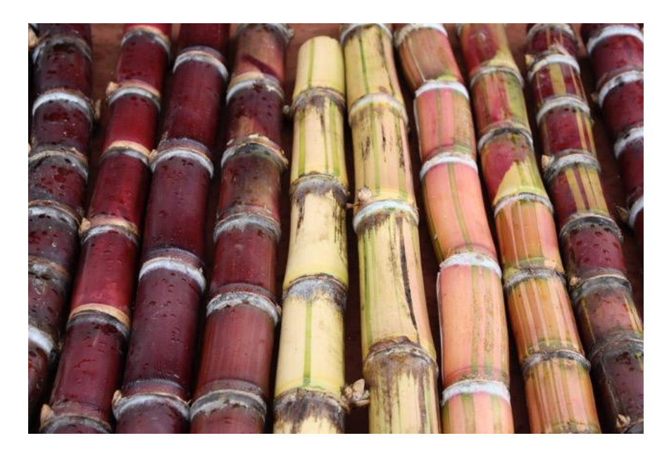
Figure 4. A subset of kō varieties illustrating some of the diversity showing, from left to right, 'Nānahu,' 'Moano,' ''Ula,' 'Laukona,' 'Hinahina,' 'Hālāli'i,' 'Pua'ole,' and 'Wai'ōhi'a.'

Simultaneously, efforts were made to share cultivars to have more material available for propagation, education and use, and to connect growers interested in kō to facilitate knowledge exchange. The entire collection was provided to over 20 private growers, with hundreds of growers receiving multiple or individual cultivars. The ethnographic and botanical research provided a stronger sense of the cultivars, and their usage and significance, which enabled outreach and education, still ongoing. Since 2010, 23 workshops on growing, identifying, and cultural uses of kō have been conducted that have reached some 600 famers and practitioners.