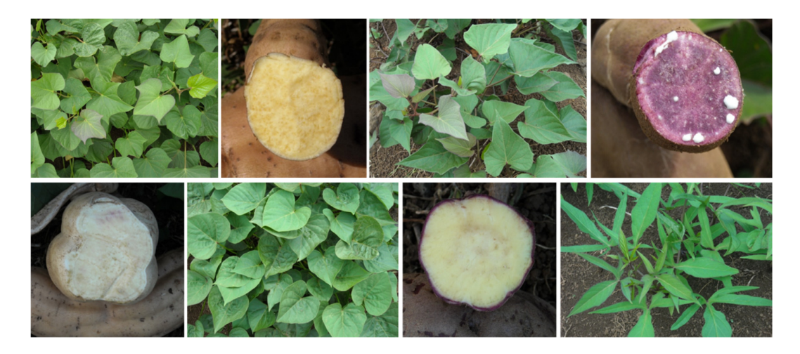
Figure 3. Four of an unknown number of extant Hawaiian 'uala cultivars (leaves and tubers): top row (L-R) 'Pala'ai,' 'Ele'ele,' and bottom row (L-R) 'Kalia,' 'Piko.'

labeling. Yet another challenge is understanding how much kahuli (mutation, sporting) has shaped the plants we know today; sports are a natural phenomenon and are well-known and described for both Māori kumara [145] and to a lesser extent for Hawaiian 'uala [33]. In conservation-oriented botanical settings where active farmer-informed selection is not occurring, mutants might be perpetuated over multiple planting cycles, leading to altered traits in key identifiers such as leaf shapes and pigments as well as differences in tuber pigments. On the flip side, breeding efforts through the 1900s [146–149] not only produced numerous hybrids, but may have also contributed to disproportionate preservation of flowering cultivars over non-flowering lineages. The extent and nature of hybrids—both natural (open-pollinated) and intentional (hand-pollinated)—in current 'uala collections remains poorly understood. Finally, the natural plasticity of 'uala traits (variation under different environmental conditions) also presents challenges in comparing 'uala observations made at different locations and times. All of the above- mix-ups, sporting, hybrids, trait plasticity, contribute to the challenge of matching today's living cultivars with older written descriptions, names, and stories.