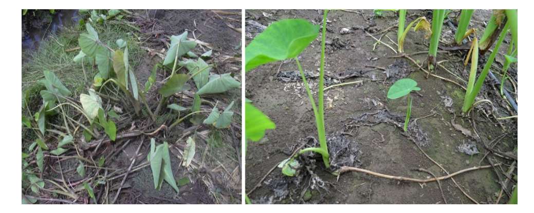
Figure 1. An almost cormless invasive hybrid taro with Lehua maoli-like characteristics (bronzing in youngest leaves; lilac purple base) removed from a wetland taro patch, Hawai'i ( left ) and runners expressed in field trials in the hybrid, Pa'lehua, one of the patented taros ( right ).

In Hawai'i, numerous undescribed and poorly-tracked introductions and crosses present a significant challenge to maintaining indigenous crop biodiversity and knowledge of kalo varieties [61]. Similarities between these introductions and Hawaiian cultivars complicate efforts to retain true-type Hawaiian and Pacific kalo collections and to help farmers differentiate among them. A tendency for invasiveness (aggressive runners) in crop cultivar introductions from outside Hawai'i and among new hybrids has become a serious issue for some kalo farmers (Figure 1).