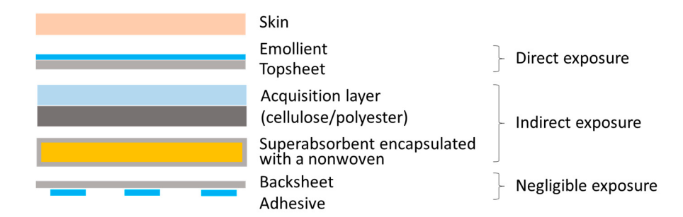
Figure 1. Layer construction of disposable sanitary pads and diapers.

The backsheet is typically made of a water-proof polyethylene or polypropylene film laminated with polypropylene nonwoven [2,14,55]. This layer prevents fluid from leaking. For feminine pads, the backsheet has adhesives to fix on cloth. Baby diapers employ different fastening system, thus do not have such adhesives on the backsheet. Constituents of the backsheet and adhesives are reported to have negligible skin exposure through reflux [14].