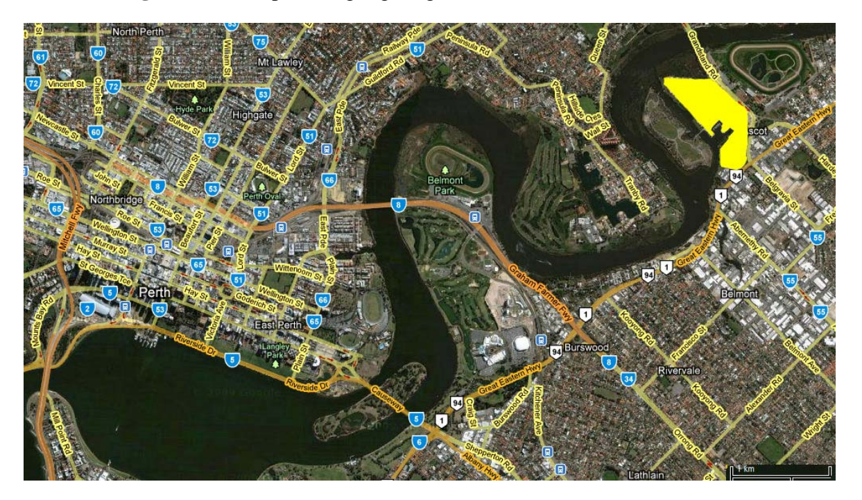
Figure 1. Aerial photo highlighting Ascot Waters in relation to Perth.

Ascot Waters, as shown in Figure 1, is located approximately 5 km east-northeast of the Perth Central Business District (CBD).