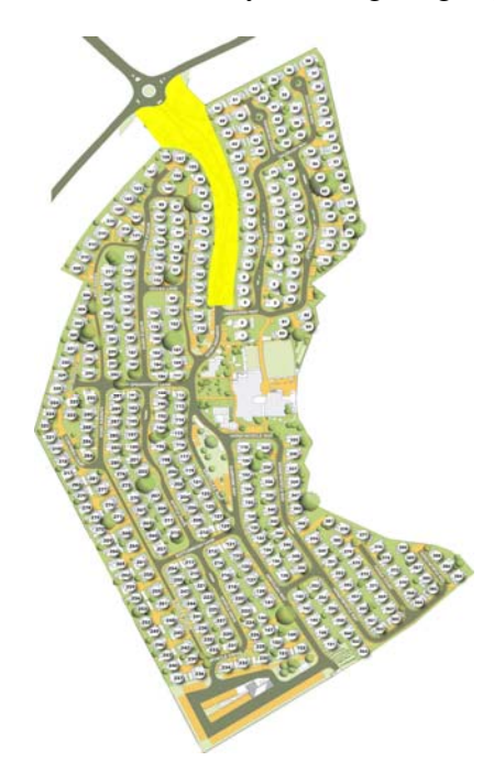
Figure 5. Map of Bridgewater National Lifestyle Village highlighting the entry analysis area.

Swales are integrated into the site along with landscaping utilising native Australian species, which are appropriate in order to achieve water conservation. These swales also use a filtering material and coarse mulch to filter out nutrients, sediment and pollutants. Road soak wells have been successfully been replaced by the swales in this instance, and also serve to create a sense of place and local identity. With regard to social usage, residents walk along the path through the entry statement area to access