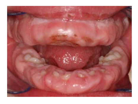
Figure 1. Intraoral view showing the severity of gingival hyperplasia in a 6-year old patient with hereditary gingival fibromatosis.

The optimal course of treatment for HGF is