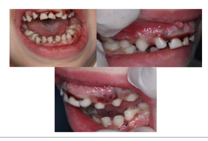
Figure 6. Buccal, left and right intra-orally views one-week post-operative.