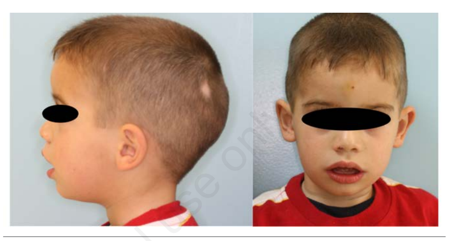
Figure 4. The patient's brother presenting similar extra-oral features.