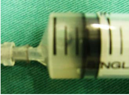
Figure 3. A specimen obtained by fine needle aspiration revealed mucus.