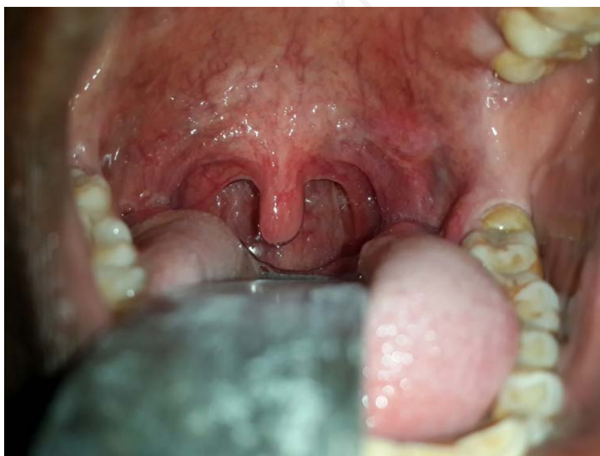
Figure 3. The post-operative clinical image of the patient at the end of 3 weeks.