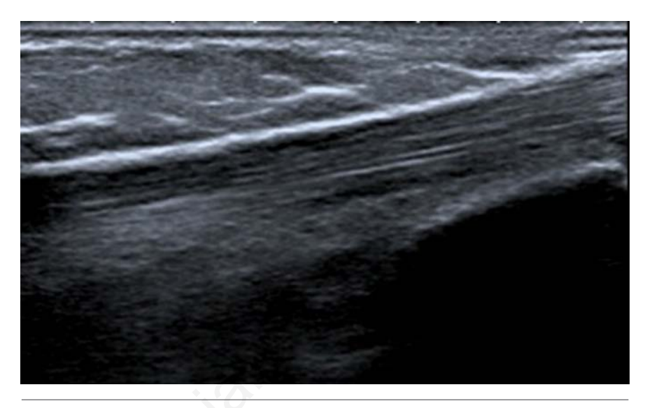
Figure 2. Ultrasound image demonstrates the normal appearance of left tibialis posterior tendon.

tomatic flexible pes planus are various activity modifications, orthosis and physiotherapy. Non-steroid anti-inflammatory drugs can be prescribed in some cases.<sup>1,5,6</sup> Comorbidities like obesity, hyper-laxity and proximal extremity problems may be present in patients. These should be identified and controlled. Orthosis and observation is adequate if symptoms are relieved with non-operative approach.<sup>1,5</sup>