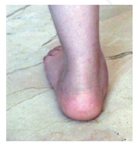
Figure 1. Too many toe sign.