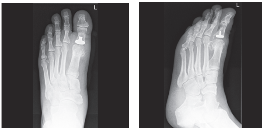
Figure 3. Radiographs 17 months postoperative.