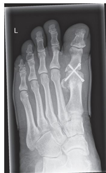
Figure 1. Radiographs showing a non-union 12 months after the fusion with 2 crossing screws in appropriate alignment.