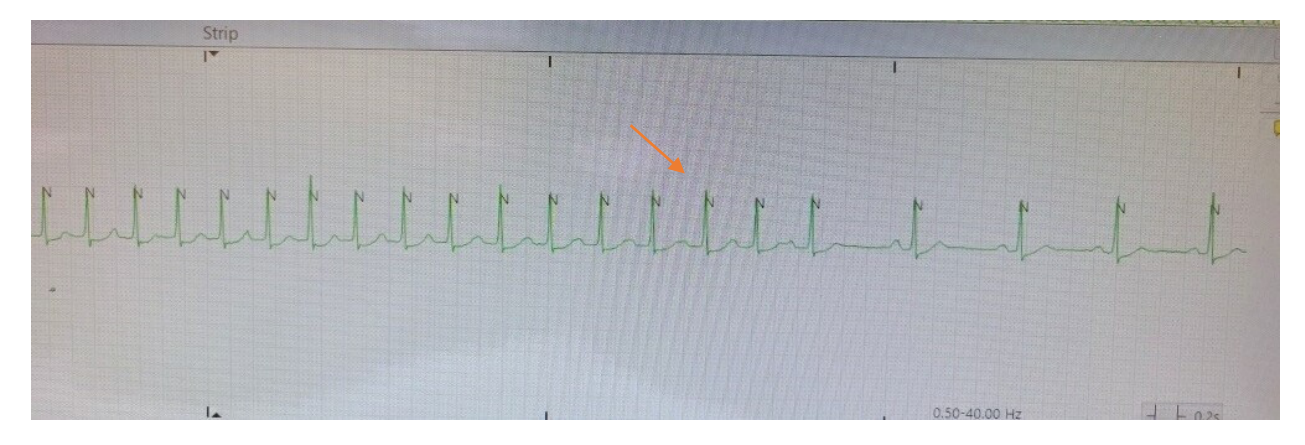
Figure 2. Telemetry strip showing resumption of normal sinus rhythm in the middle of the tracing at a rate of 126 bpm. The arrow draw attention to the cool down phenomenon before termination.

The spontaneous termination of the tachycardia displayed in Figure 2 showing a typical "cool-down" phenomenon of gradual slowing of the tachycardic rate before cessation. During the rate slowing one can now discern the P waves, which were previously merging with the T wave and could not be clearly distinguished, with progressive lengthening of the PP cycle length.