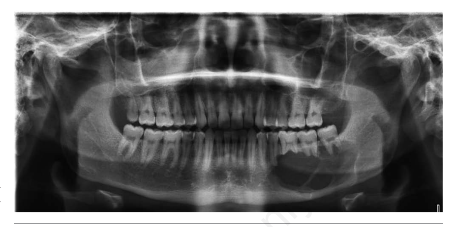
Figure 1. Panoramic radiograph showing multi-locular lesion in the mandibular posterior region.

with attachment of basal cell layer to the underlying basement membrane. Histopathologically, this artifact looks exactly similar to the pemphigus and Darier's disease.<sup>13</sup> In the present case, possibility of fix-