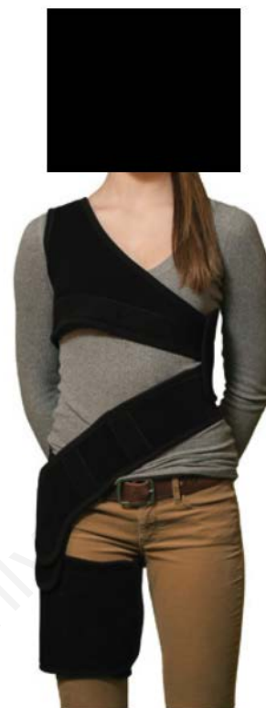
Figure 1. This figure illustrates a sample configuration of the scoliosis activity suit.

The SOSORT Guidelines also recommend reporting results based upon the percentages of patients who improve by >5^{\circ} , stay within \pm 5^{\circ} of baseline, and progress by more than 5^{\circ} . 10 The treatment group had 7 of the 9 patients (78%) remain within \pm 5^{\circ} , 1