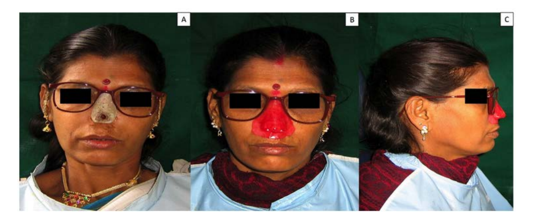
Figure 3. A) Acrylic stent trial; B) Wax up trial frontal view; C) Wax up trial lateral view (clinical photo published with patients permission).

(preferably) daylight is attained.8 A similar procedure was followed in the current case report.