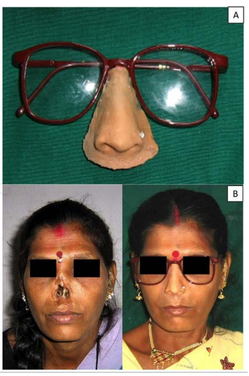
Figure 4. A) Final prosthesis with spectacles; B) Pre and post prosthesis comparison (clinical photo published with patients permission).

It can be inferred from the present case report that silicone is one of the most acceptable materials for the fabrication of maxillofacial prosthesis. A custom made