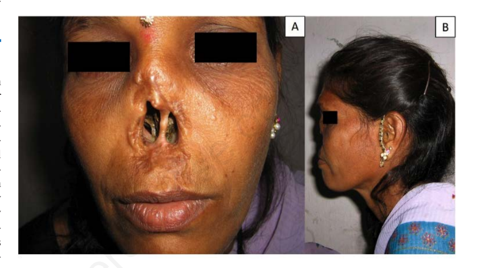
Figure 1. A) Post-operative frontal view; B) Post-operative lateral view (clinical photo published with patients permission).

A challenge that a clinician faces while fabricating a maxillofacial prosthesis is obtaining a proper skin color match. A skin color match is achieved by adding suitable pigments to translucent silicone elastomers until an acceptable color match under