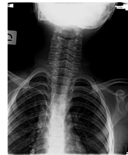
Figure 4. Case #2. Tip position after 6 years.