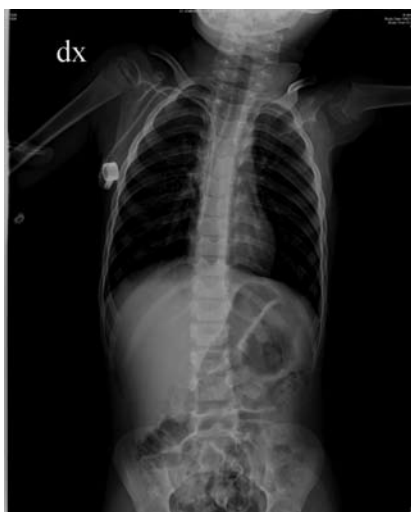
Figure 3. Case #2. Initial tip position.