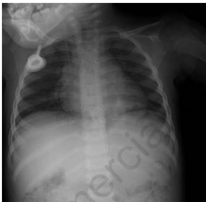
Figure 8. Case #3. Tip position after 2 years.