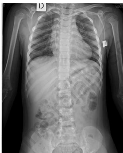
Figure 1. Case #1. Initial tip position.

A limited presence of subcutaneous tissue can cause skin decubitus.