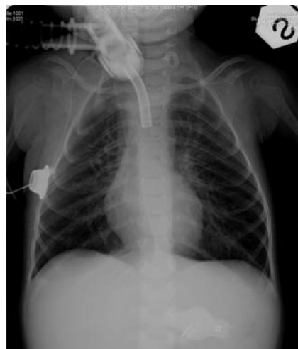
Figure 5. Case #3. Initial tip position.