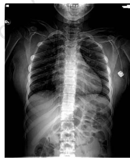
Figure 2. Case #1. Tip position after 6 years.