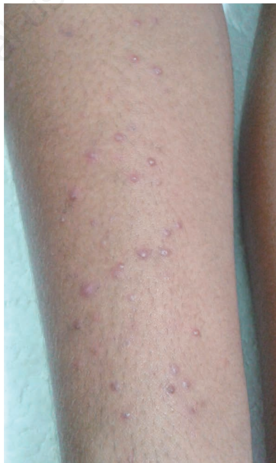
Figure 2. Monomorphic papules on the forearm of a patient with Gianotti-Crosti syndrome, also known as papular acrodermatitis of childhood.

PR exhibits virtually absolute universality. The predominant age being 10-35 years might be due to viral primary infection for some patients and endogenous reactivation for others. Concurrent patients and patient clustering are well proven. We thus believe that the epidemiological evidence strongly substantiates PR being caused by infectious agents.