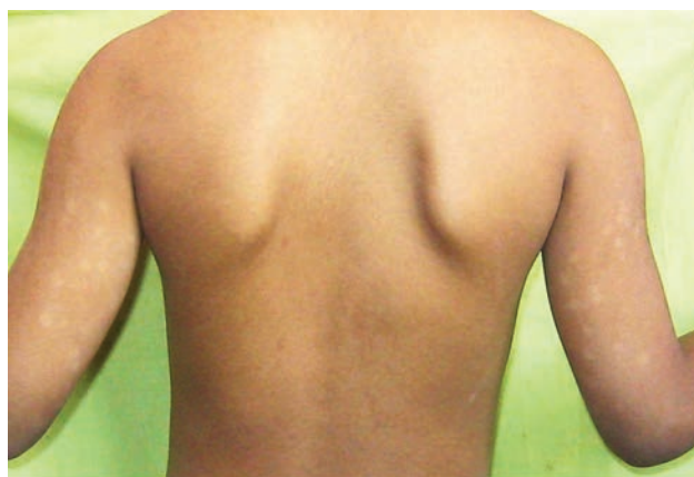
Figure 4. Eruptive hypomelanosis is a recently reported paraviral exanthem with round or oval hypopigmented patch seen after a prodromal phase. The commonest sites are extensor surfaces of the limbs, as seen in this child with lesions at extensor aspects of bilateral arms.