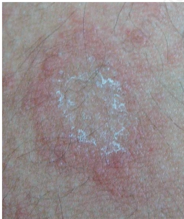
Figure 1. A herald patch demonstrating peripheral collarette scaling in a patient with pityriasis rosea

PR is associated with respiratory tract infections, 56 suggesting a droplet-spread micro-organism being the cause.