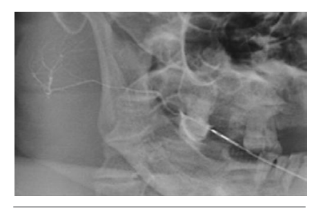
Figure 2. Normal right parotid sialogram.