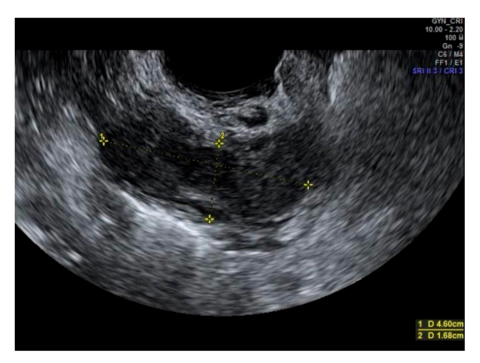
Figure 1. Ultrasound revealed bilaterally increased adnexa with dishomogeneous echostructure.

A 67-year-old Italian woman (para 2) presented to our institute with a 1-month history of intermittent lower abdominal pain, fever, and asthenia. She had no medical, surgical, or family history of malignancy. Blood tests showed elevated levels of CA125 (671 U/mL, normal range 0–35 U/mL) and C-reactive protein (CRP) (220 mg/L, normal range < 2.9 mg/L). Complete blood count was normal. Gynecologic ultrasound revealed increased adnexa bilaterally with inhomogeneous echostructure (Figure 1). The right one was 52 \times 39 mm, whereas the left one was 46 \times 31 mm. Multiple nodular formations were spread across the surface (Figure 2).