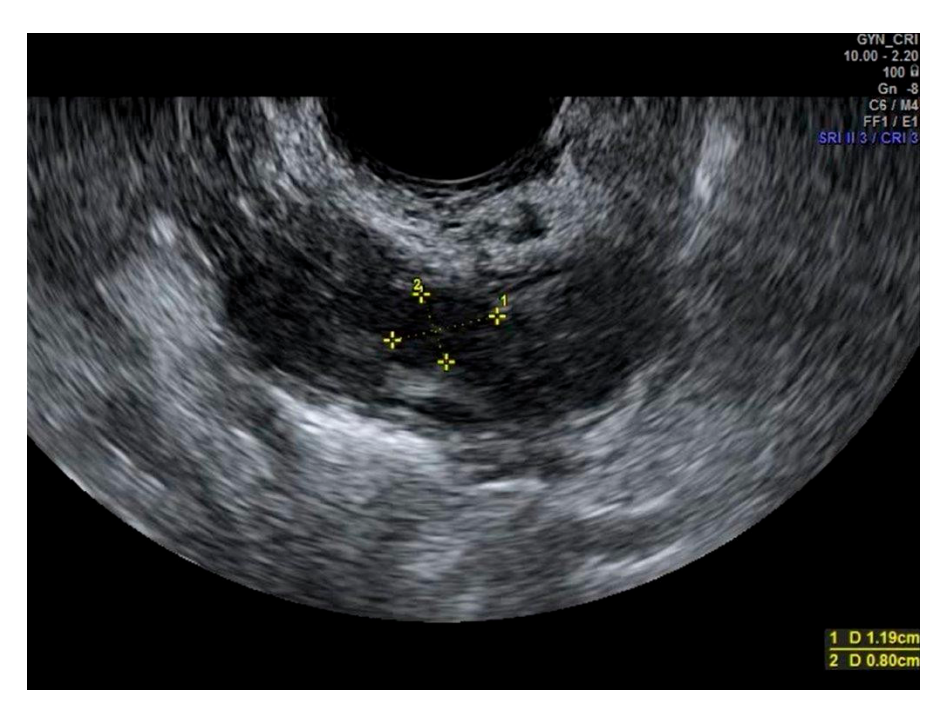
Figure 2. Multiple nodular formations were spread across the surface.