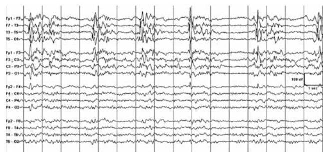
Figure 1. Electroencephalogram of Patient A showing left-sided burst suppression 45 minutes after status epilepticus termination with fosphenytoin 1000 mg, lorazepam 4 mg, and propofol 2 mg/kg load. The occasional right-sided sharp waves that stand out against the low-amplitude slow background activity are most likely the result of volume conduction from the left hemisphere source. Unihemispheric burst suppression persisted as propofol was being infused at 2 mg/kg/hr and disappeared 4 hours later when the infusion rate was 5 mg/kg/hr. Propofol was discontinued after 12 hours with no recurrence of seizure activity and unihemispheric burst suppression.