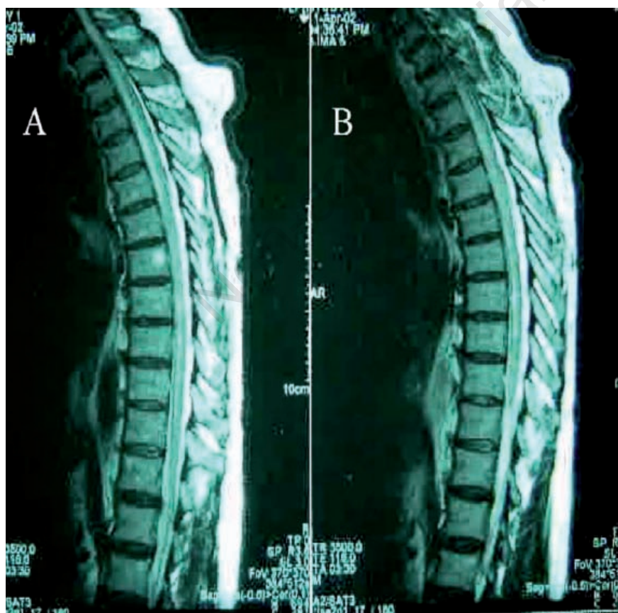
Figure 1. A and B Magnetic resonance image of dorsal spinal cord showing an enhanced signal in a patient presenting acute myelitis. Sagittal plane, T2 sequence.

Several viruses have been associated with inducing benign acute myositis. In a study in India, 50% of benign acute childhood myositis cases were attributed to dengue infection. 23 Myositis has a wide clinical spectrum, ranging from mild proximal asymmetrical weakness of the lower limbs to severe, rapidly progressing,