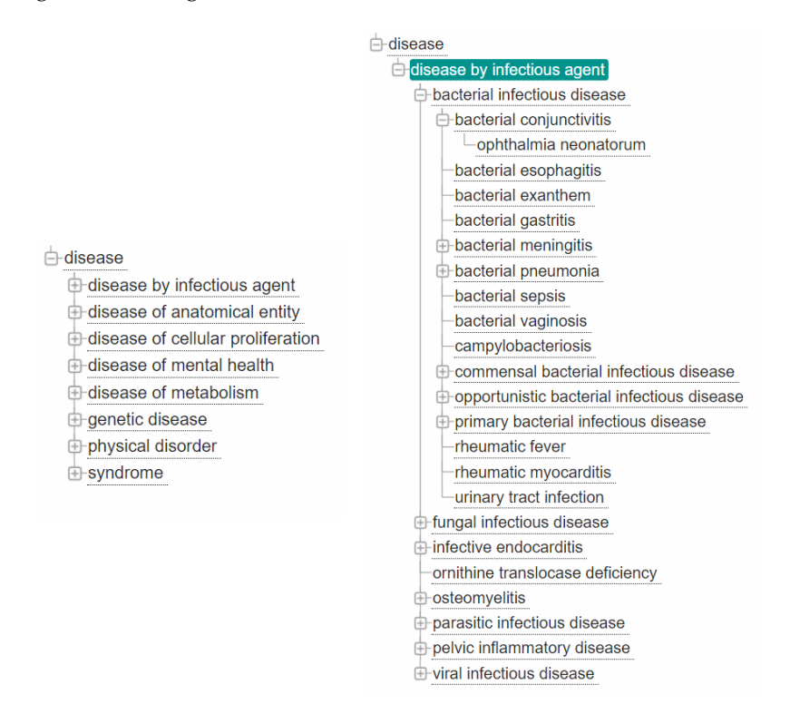
Figure 3. On the left , the main branches of the Human Disease Ontology and on the right some classes that derive from the first disease, or disease by infectious agent.

HDO [5] was developed as a standardised ontology for human disease with the aim of providing the biomedical community with consistent, reusable, and sustainable vocabulary of human diseases, including terms, descriptions, phenotype characteristics, and related medical concepts. The ontology represents over 8000 diseases that can be found through names, synonyms, and definitions. Figure 3 shows the main classifications of diseases (on the left) and next to it an example of the branching of the disease caused by an infectious agent (on the right).