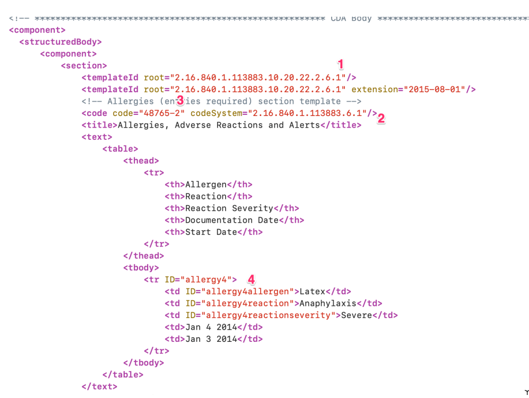
Figure 1. Snippet of XML code displaying intrinsic syntactic complexity despite being extracted from a simple, basic example of CDA document. Points marked 1 to 4 highlight the following tags: root, codeSystem, code, and ID, respectively.