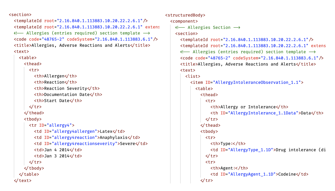
Figure 2. Comparison of two XML files with different structures but the same type of content.