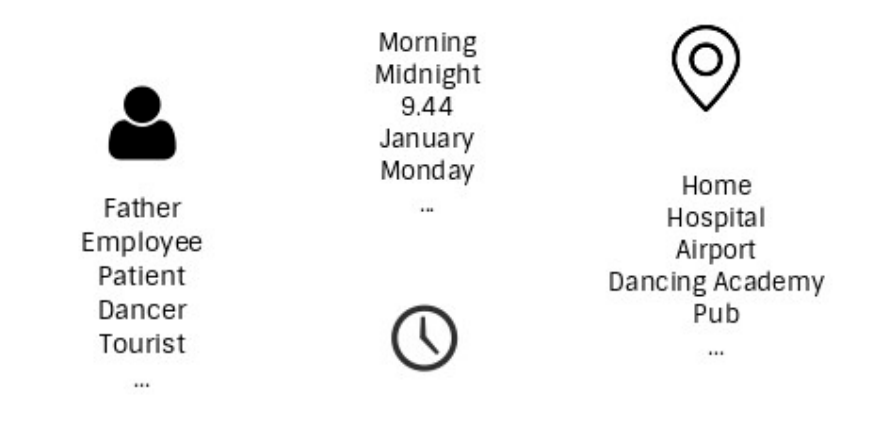
Figure 2. User's face in different stages.

Figure 2 shows how user's faces can function in different stages. For example, faces can be labeled as "Father", "Employee", "Patient, "Dancer", and "Tourist", etc. Social encounters are public performances that take place in specific settings, which are named "frames" by social theory. Users benefit from different faces, which can be utilized or dropped accordingly so as to warrant a successful engagement in social media practices [2].