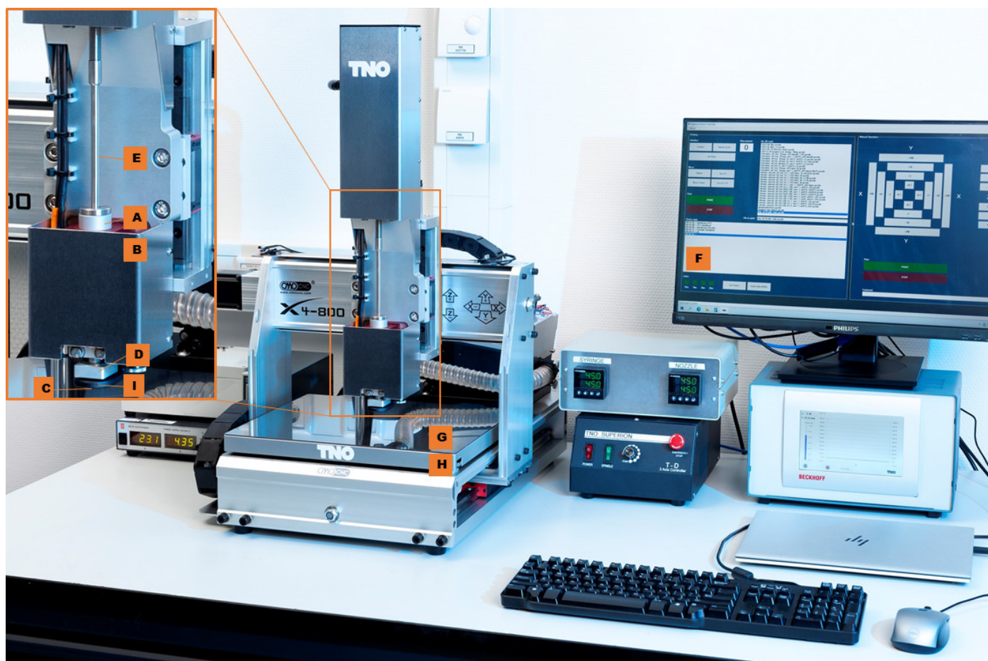
Figure 2. Used printer setup; syringe (A), the heating element of the syringe (B), nozzle (C), the heating element of the nozzle (D), piston (E), computer with Pronterface (F), printing platform (G), heating bed (H), and cooling (I).

platform (G), as the formulation cools too quickly, the platform could be heated with a separate heating bed (H). On the contrary, if the formulations did not solidify due to residence heat, air cooling (I) could be applied to enhance the solidification of the tablet.